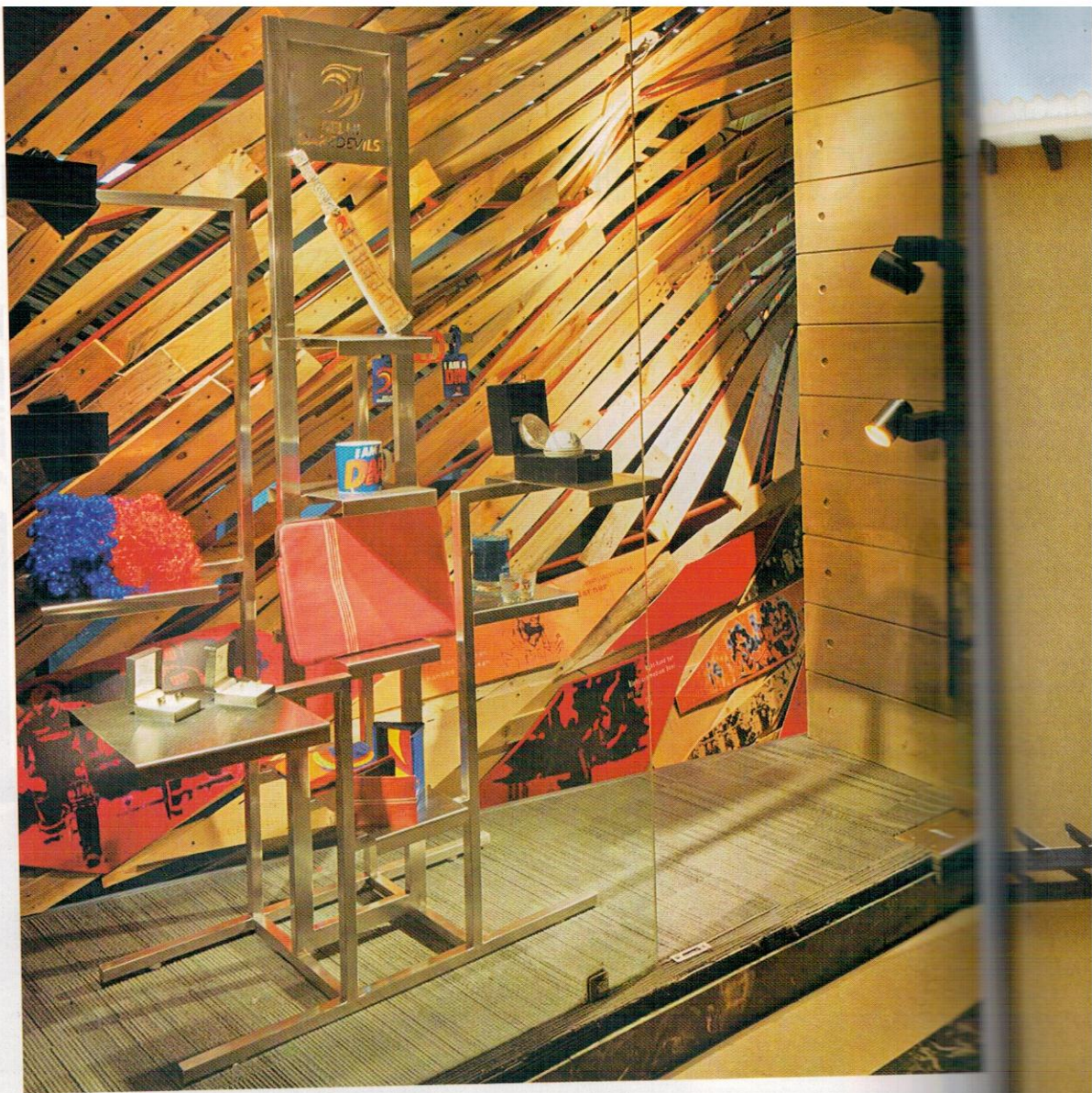
The merchandise display offers passers-by a quick glance for about what the team has for its fans.