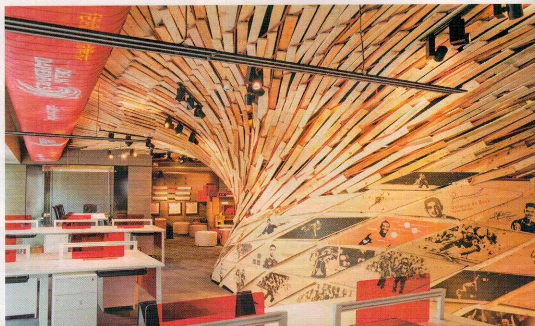
ABOVE: Crystal clear cabins capture the essence of lively Delhi on its walls.