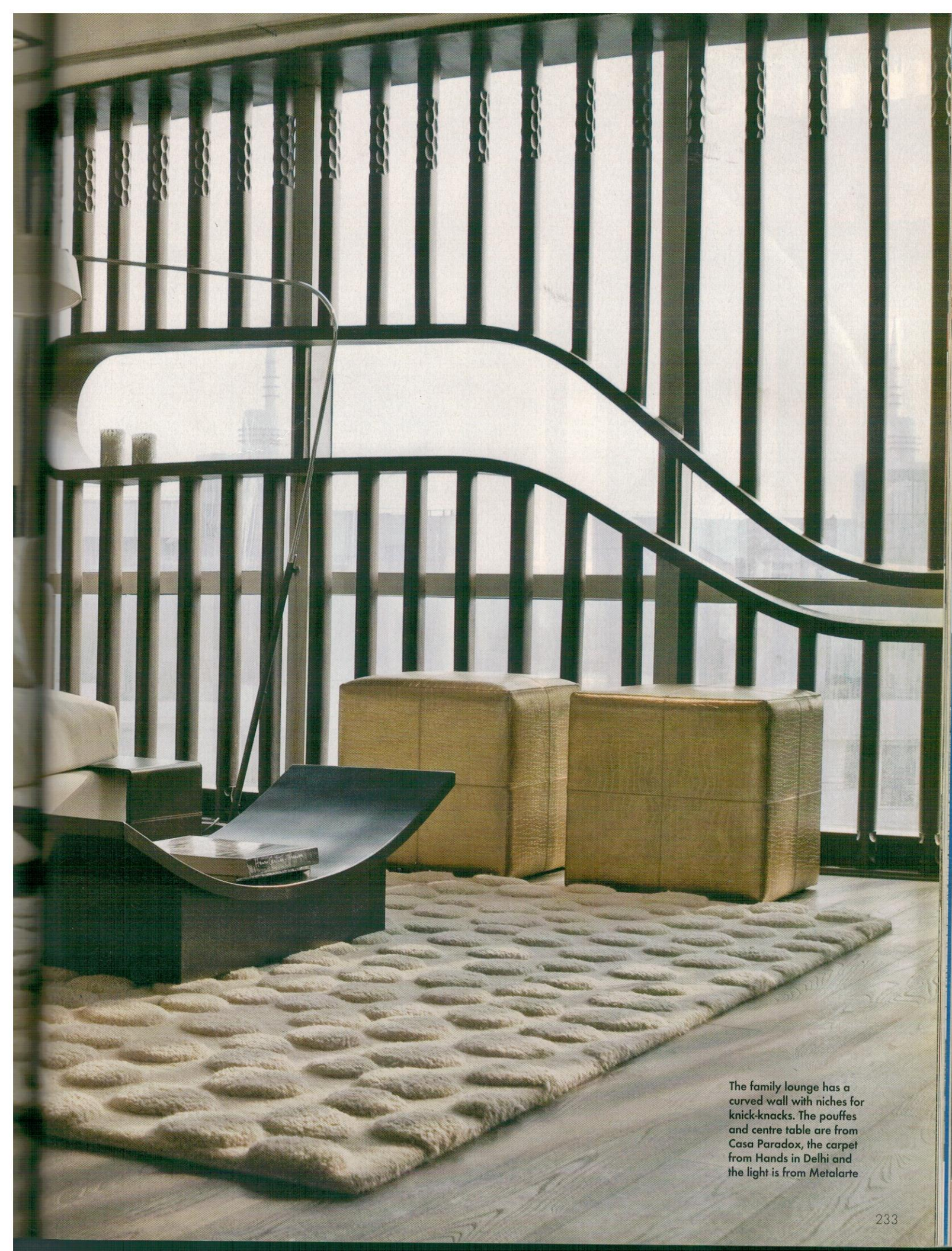
The family lounge has a curved wall with niches for knick-knacks. The pouffes and centre table are from Casa Paradox, the carpet from Hands in Delhi and the light is from Metalarte