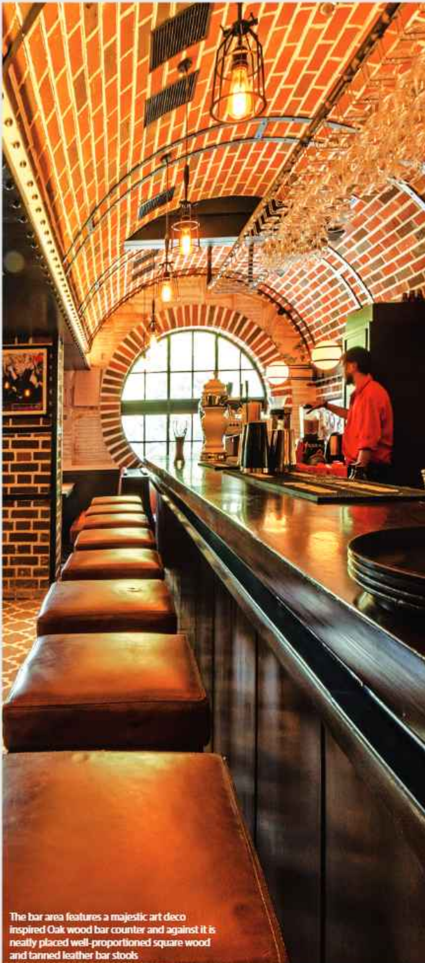
The bar area features a majestic art deco inspired Oak wood bar counter and against it is neatly placed well-proportioned square wood and tanned leather bar stools

“The lower level of the restaurant features the bar area along with twin circular windows whereas the upper level features the restaurant area along with the oversized square windows continued over as skylights”