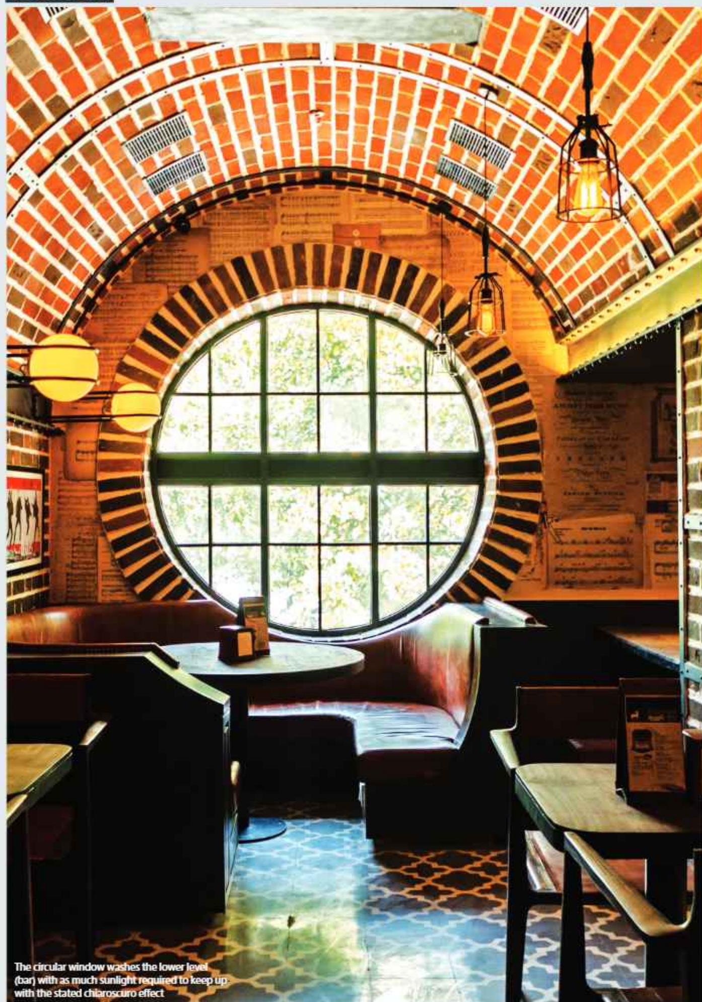
The circular window washes the lower level (bar) with as much sunlight required to keep up with the stated chiaroscuro effect